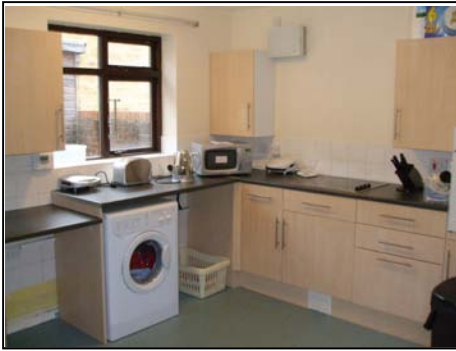
INSIDE HARRIET HOUSE