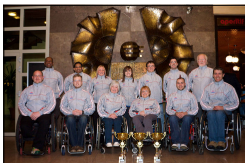
The DTSGB Team