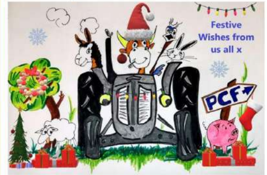
Santa is visiting Princess Christian's Farm

Monday 19 - Friday 23 December 2022 10.30-am-12pm and 12.30-2.30 pm